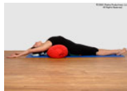
Setu Bandha Sarvangasana (modified)