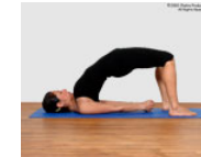
Setu Bandha Sarvangasana